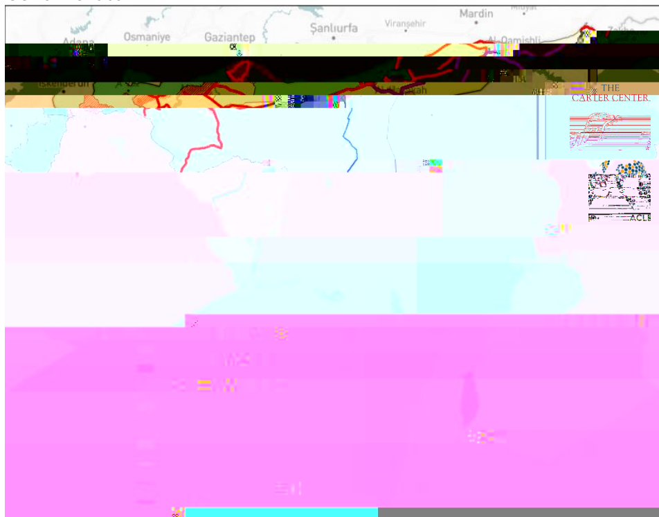
Figure 1: Dominant actors' area of control and influence in Syria as of 28 March 2021.-NSOAG stands for Non-state Organized Armed Groups. Also, please see footnote 1.