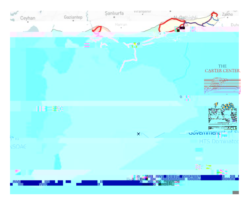
Figure 1: Dominant actors' area of control and influence in Syria as of 28 June 2020. NSOAG stands for Non-state Organized Armed Groups. Also, please see the footnote on page 2.