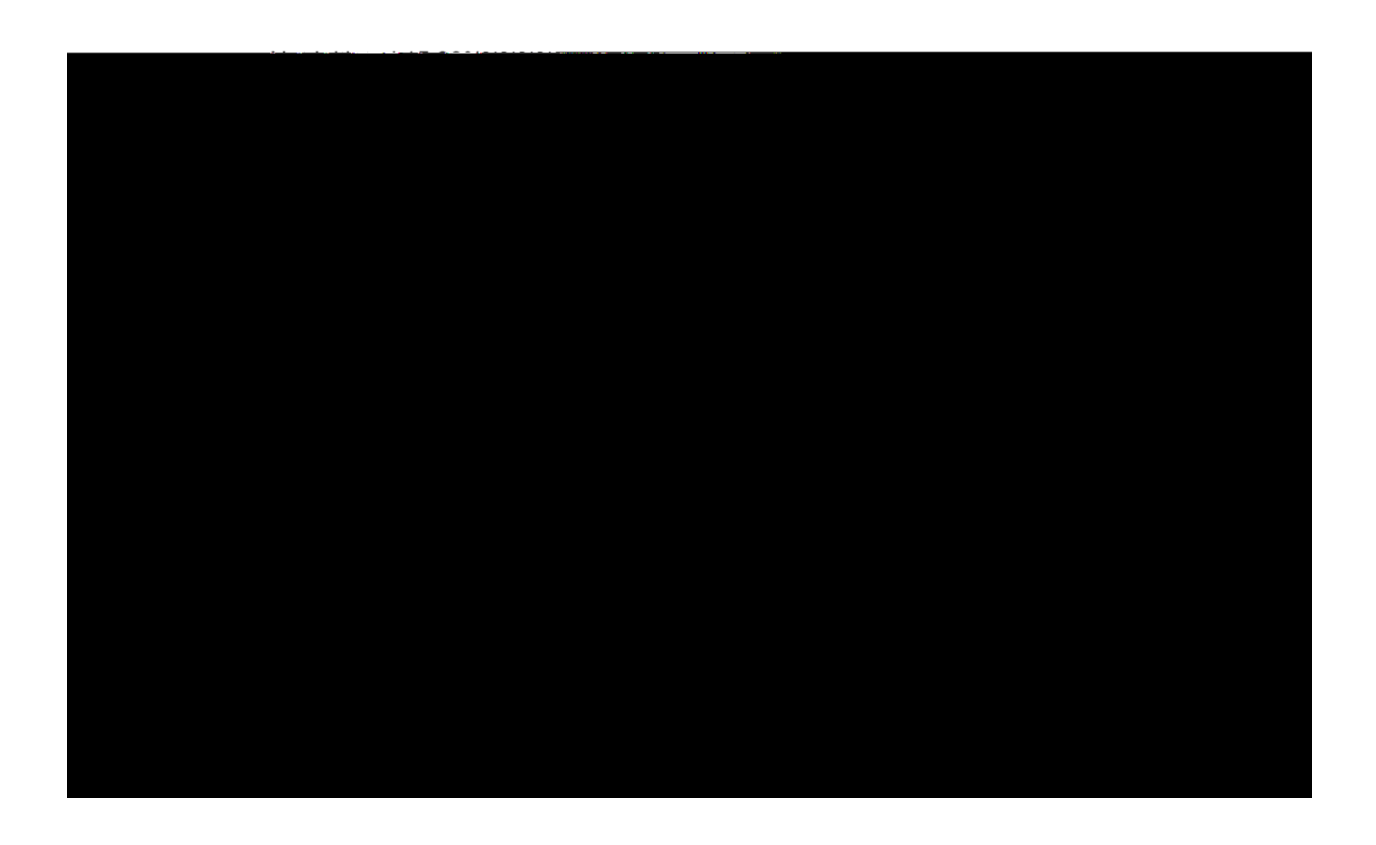
Figure 1 Overall Status of Implementation of the Agreement